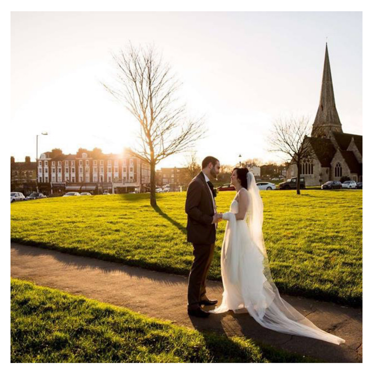
The Clarendon, Blackheath Village,