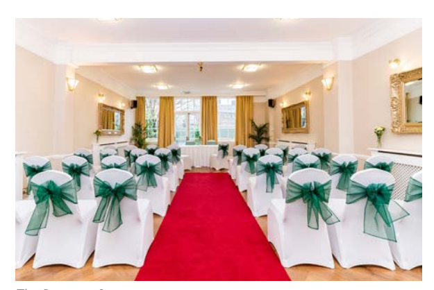
The Regency Suite