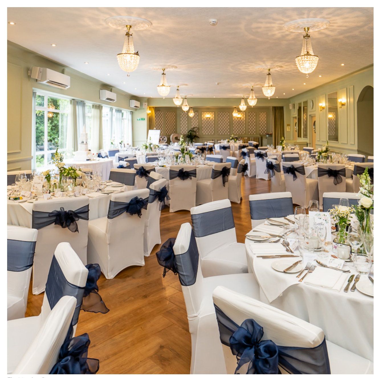
The Meridian Restaurant