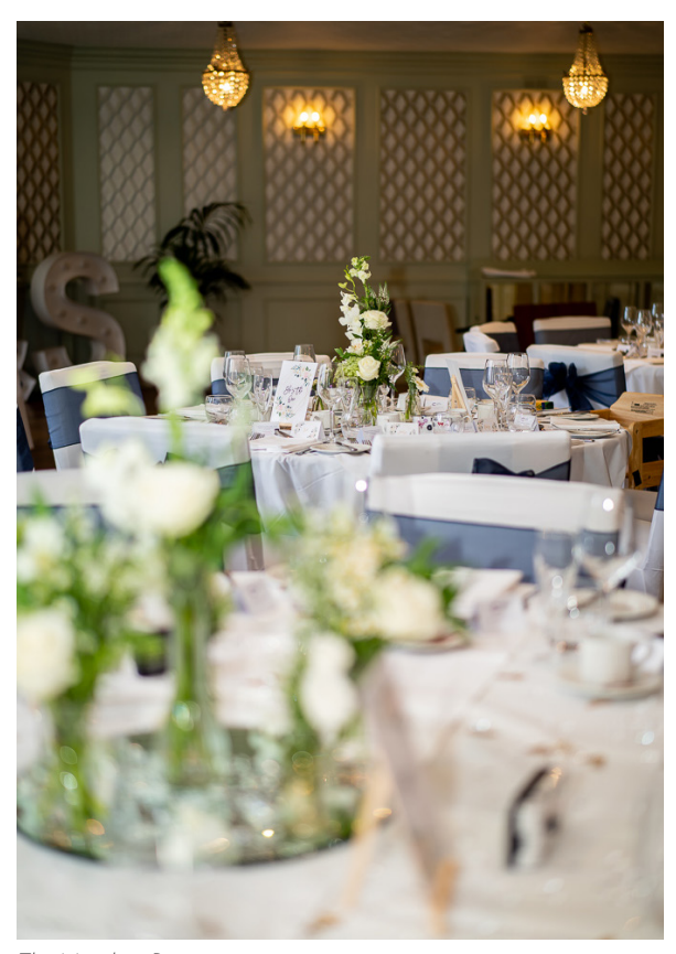
The Meridian Restaurant

The Clarendon is licensed for Civil Marriages and Partnerships.