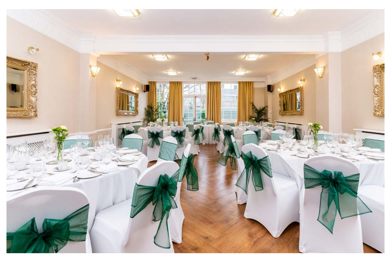
The Regency Suite

We have an excellent selection of beautifully refurbished and individual rooms available for hire for both wedding ceremonies and wedding receptions.