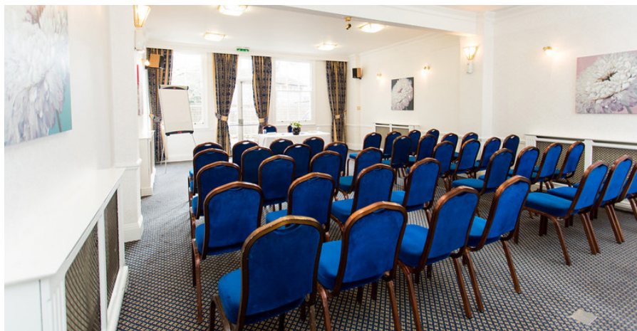
The Regency Suite

Max. 4 hrs - £500.00 inc. VAT | Max. 8 hrs - £800.00 inc. VAT